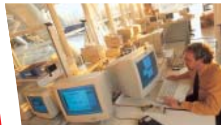
SMF/SMI Maximum protection within limited space.