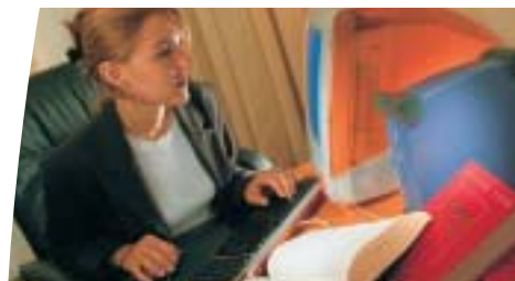
For professional people Safety in a sophisticated design.

Protection for 1 to 3 PCs or Macintosh computers