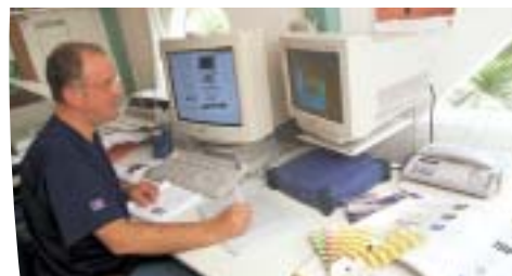
Graphic artists A single UPS, powerful and elegant. Ideally suited to the Mac user.